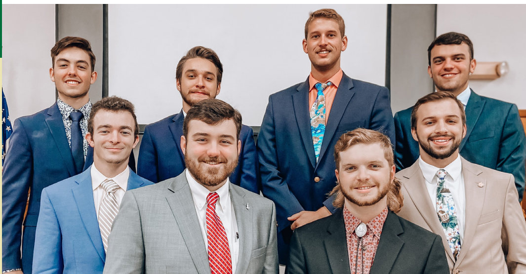
The members of the 2021 Executive Board.

PSRST STD U.S. POSTAGE PAID MAILED FROM ZIP CODE 66044 PERMIT #570