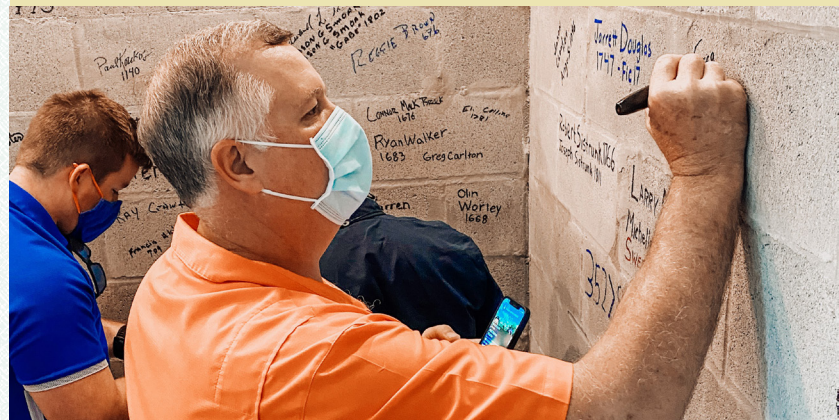
Undergraduates and alumni sign the basement concrete walls in the new chapter house.

VNR of Planning Cason Adams '18 Food and Resource Economics