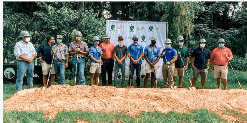
Brothers attend the new chapter house's ground breaking ceremony last August.